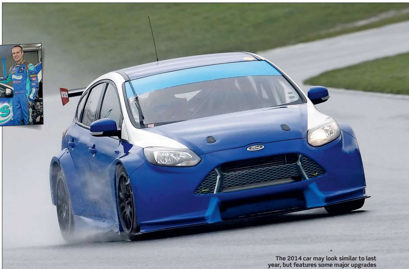
The 2014 car may look similar to last year, but features some major upgrades