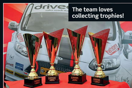
The team loves collecting trophies!