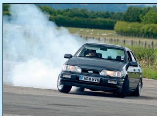
ADE SAPPHIRE COSWORTH