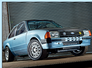
WENNY ESCORT MK3