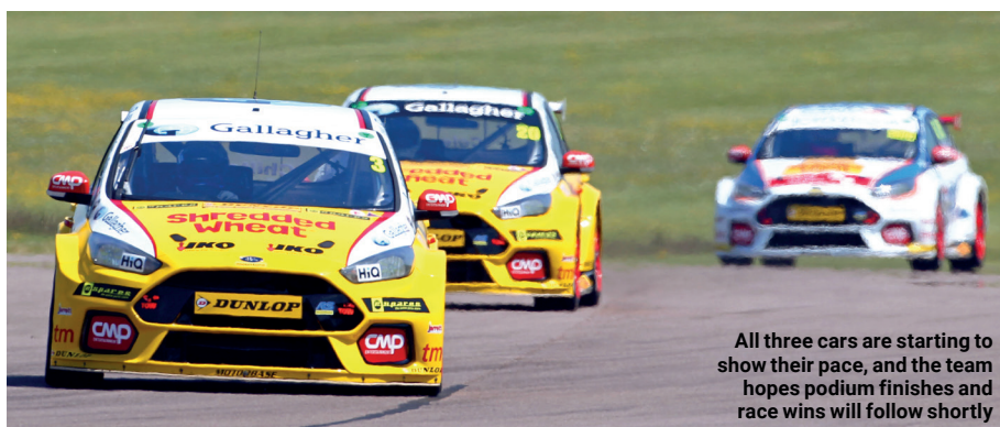
All three cars are starting to show their pace, and the team hopes podium finishes and race wins will follow shortly